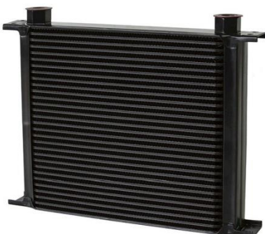
AF72-4000 Modular Oil Cooler Mounting Kit

When mounting this product ensure to clean out inside of the cooler and that it is free of any aluminium chips or burrs that could become dislodged in operation. We recommend the use of the Aeroflow Performance oil cooler mounting kit (sold separately AF72-4000) when using any oil cooler. This will provide a solid and stable mounting platform to secure the cooler in place when in use.