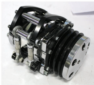
6. Side view of bracket assembly fitted to compressor.