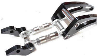
3. Assemble brackets and fasteners as per picture shown.